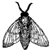
Figure 2: A sample black and white graphic that has been resized with the includegraphics command.

the page nearest their initial cite. To ensure this proper “floating” placement of figures, use the environment figure to enclose the figure and its caption.